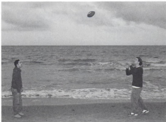
1. A ball in flight I

Nevertheless, because scientific observations are never completely direct and conclusive, we need a better way to describe the relationship between science and mathematics. Mathematicians do not apply scientific theories directly to the world but rather to models . A model in this sense can be thought of as an imaginary, simplified version of the part of the world being studied, one in which exact calculations are possible. In the case of the stone, the relationship between the world and the model is something like the relationship between Figures 1 and 2.