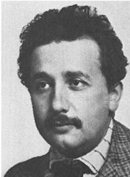
Figure I.1. Einstein at the patent office.

Einstein began a two-year period of odd tutoring jobs. One wonders what would have happened if Marcel Grossman's father had not helped him to get a job in 1902 as a patent examiner at the Swiss Federal Patent Office in Bern. He became a "technical expert third class," with an annual salary of 3,500 Swiss francs (see Figure I.1). I have read different accounts of how much time his job left him for doing physics. One thing is certain. It was a serious job which he took seriously. A few of his patent assessments are still extant. They are thorough and sometimes sharply negative. Einstein may have, especially in his later years, looked like a benign presence, but he had a very cutting tongue that also got him in trouble. He had no time to actually carry out calculations during patent office working hours, but that nothing could stop him from