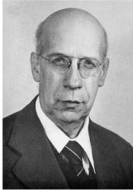
Figure I.2. Philipp Frank.

in their ways profoundly religious. Both men were, and are, to historians and biographers and to me, endlessly interesting.