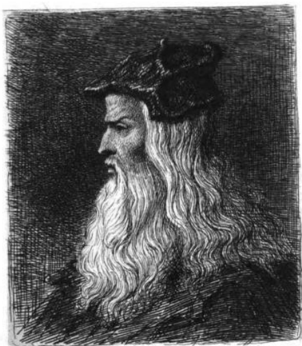
Joseph Flaxman Leonardo da Vinci